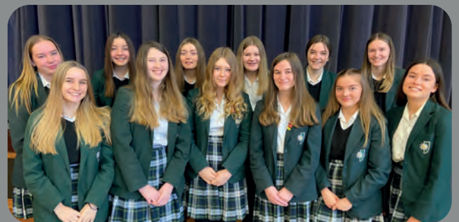
Under 16 Football Team