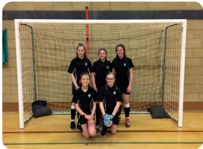
Year 8 Futsal Team

Congratulations to the Year 8 Futsal team who won their tournament against the other schools within the Kesteven Schools Sports Association (KSSA).