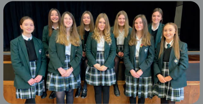
Under 15 Football Team