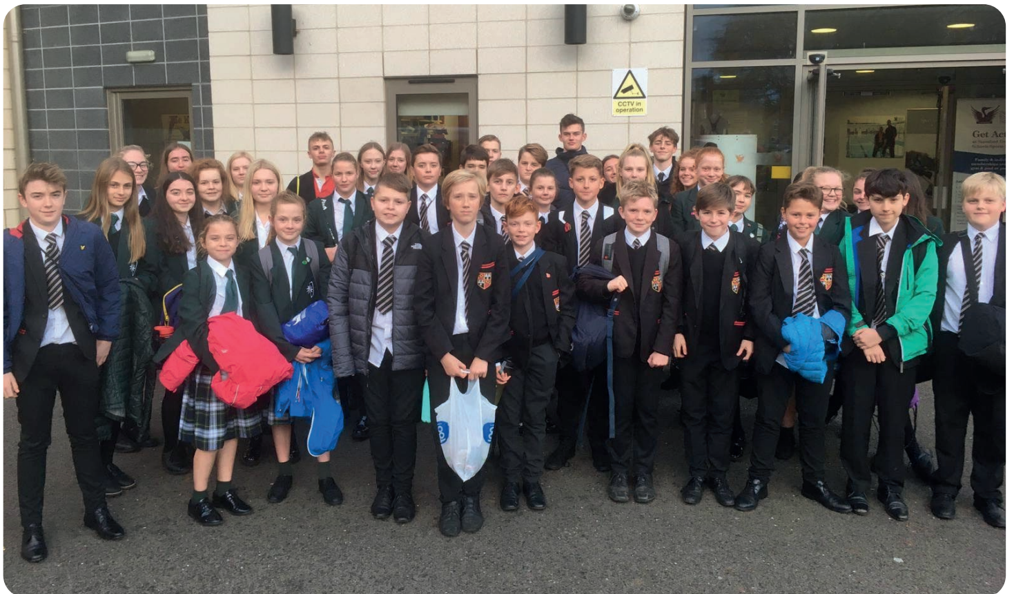
RCT Swimming Team