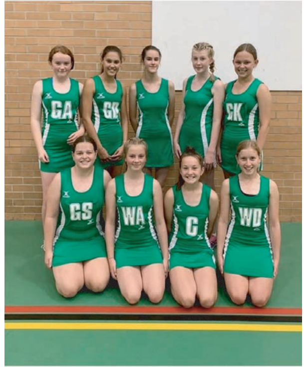
Year 9 Netball Team