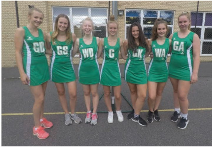
Year 11 Netball Team

Congratulations to both the U14 and U16 KSHS Netball teams who have both made it through to the County Netball Final to be held at Skegness. Good luck to all!